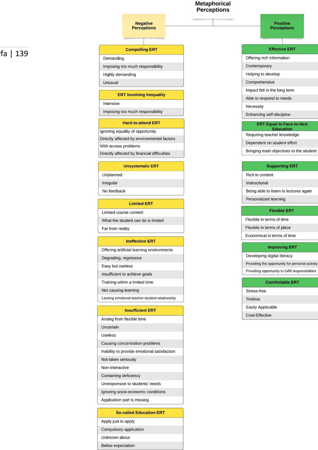
Figure 2. Summary of the results of the second research question

Yavuz, M. & Kaplan, Y.U. (2024). Investigation of EFL students' readiness and metaphorical perceptions for emergency remote teaching . Western Anatolia Journal of Educational Sciences, 15(1), 116-150. DOI. 10.51460/baebd.1395369