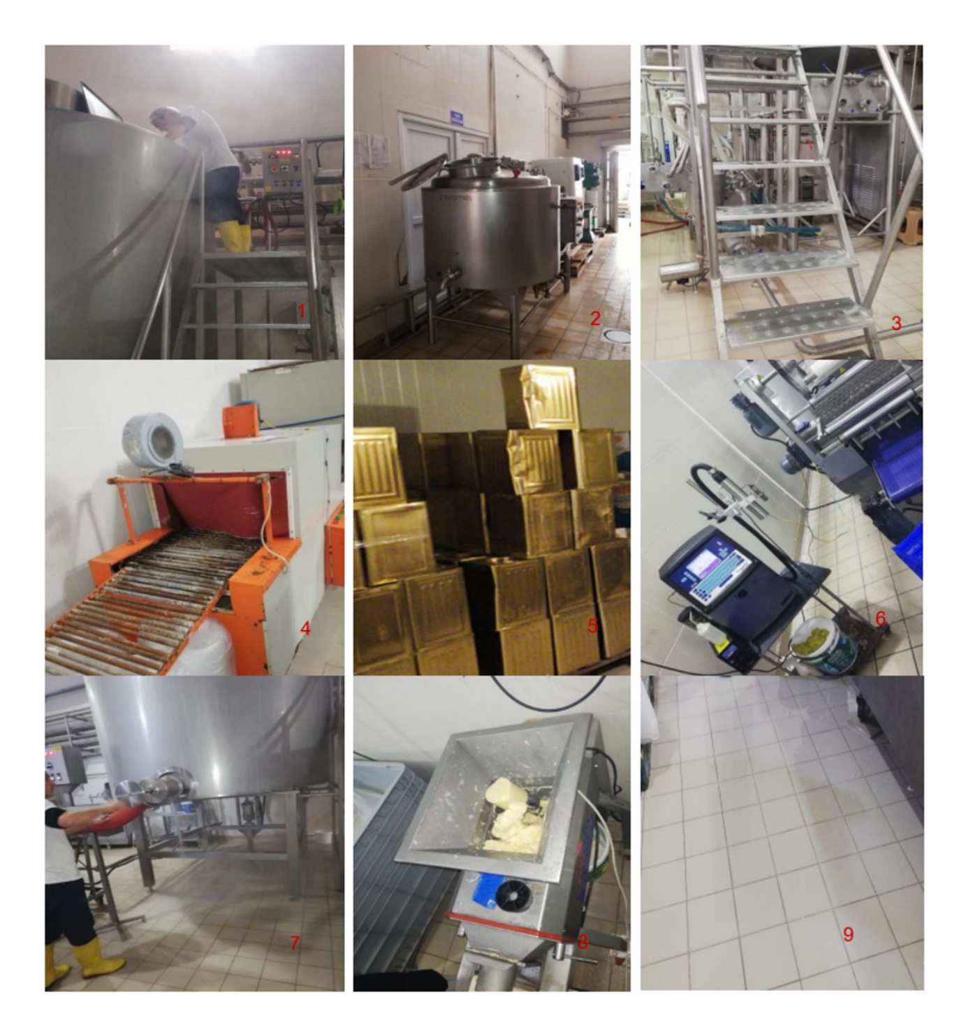
Figure 3. Photographic report on working environment hazards. The different risks identified are illustrated in the photographic report. Physical and ergonomic risk. Physical and ergonomic risk (1,2,3), ergonomic risk (2,4,5), accident risk (1,8,9), physical risk (1,2,5,7) and (9), physical and accident risk (1,2,3,4,6), accident risk (8), hygiene risk (6).

incidents of violence and threats ( l : 3, f : 2, s : 3). Moreover, unprofessional behavior ( l : 3, f : 2, s : 3), lack of respect for employees' ideas, and insufficient information flow ( l : 3, f : 2, s : 7) have been highlighted, alongside the issue of unclear definition of employees' authority and responsibilities ( l : 3, f : 2, s : 7). It is essential to prevent any acts of violence and threats during work and strictly prohibit such behaviors within the hierarchical structure of the company. Providing employees with information