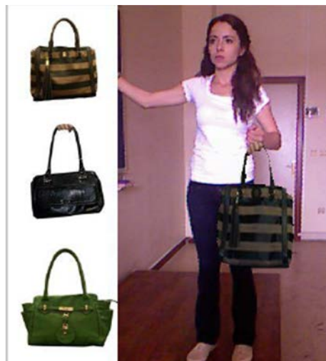
Figure 5 Selecting a Handbag using Hand Motions

Owing to the reference voices, the system can compare between the voices. Before starting the application, the voices were collected in a database. Voices were obtained two second long, .wav format in a noiseless environment. Then the voices were divided into the audio component in Matlab platform.