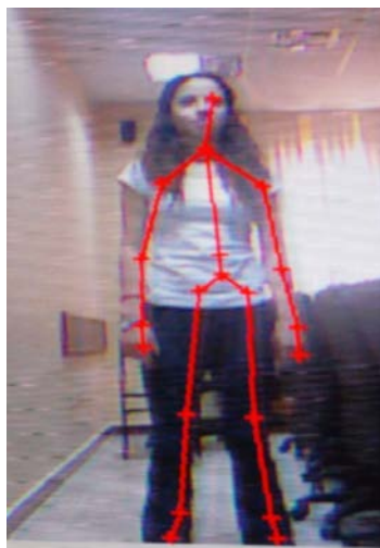
Figure 3 Skeleton Joints Found by Kinect Sensor

Kinect sensor detects 6 people owing to the camera emitting infrared rays. It can follow 2 of them active movements. As shown in Figure 3 Kinect can find 20 skeleton joints of human body. Various movements of human are defined in Kinect software. With giving motion sensing command to Kinect, IR camera emits infrared rays to the possible human's hand, arm and foot points. If human is detected at these points, CMOS sensors open and movement begins to be defined. If this movement is defined in Kinect Sensor, signal is sent to the computer else Kinect is put on hold [15].