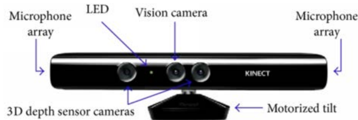
Figure 2 Microsoft Kinect Sensor [17]

Kinect Sensor has been developed for Xbox game console by Microsoft (Figure 2). Then it has been adapted to computer software world. Kinect can connect to computer with Universal Serial Bus (USB) and also requires 5V power from an external source [15]. The vision system of the Kinect sensor is composed of two cameras; RGB (Red-Green-Blue) camera and IR camera. And it contains an IR projector which is responsible of shooting infrared rays toward the environment. The distortion degree of each ray projected against the scene is used to estimate a depth map of the environments [16].