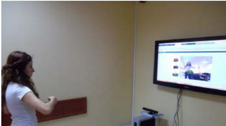
Figure 4 Proposed Virtual Mirror System

this handbag picture is inserted on the right hand joints by the system (Figure 5). To placement the handbag on the human skeleton body it was also benefited Kinect Sensor Skeleton Map.