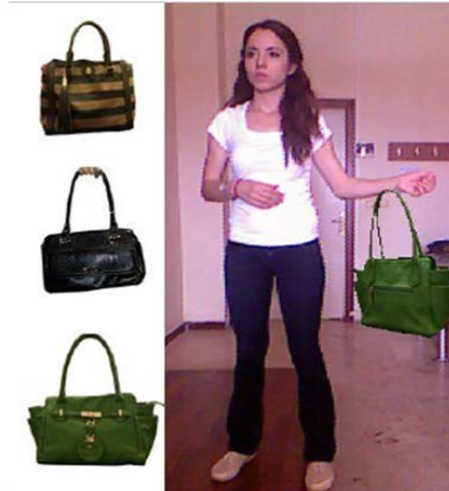
Figure 7 Example of Synchronization Failure